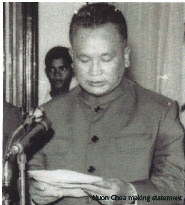
Nuon Chea making statement

To repay the debt of gratitude to our army, all of us, whether in it or outside, must pledge ourselves in memory of our combatants and our people to carry on the tradition of our heroes, who fought valiantly in past struggles, by continuing to perform correctly their revolutionary tasks and by fulfilling in the best way possible the tasks of defending and building the country. If we fulfill these tasks with great care and a high sense of responsibility, then all of us will be repaying properly and fully the debt of gratitude to our heroes. To do so is our